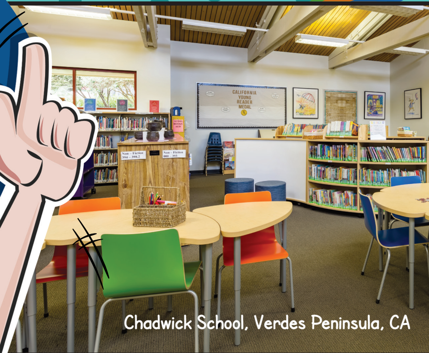
Chadwick School, Verdes Peninsula, CA